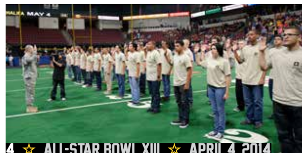
4 ☆ ALL-STAR BOWL XIII ☆ APRIL 4, 2014 ☆ 5